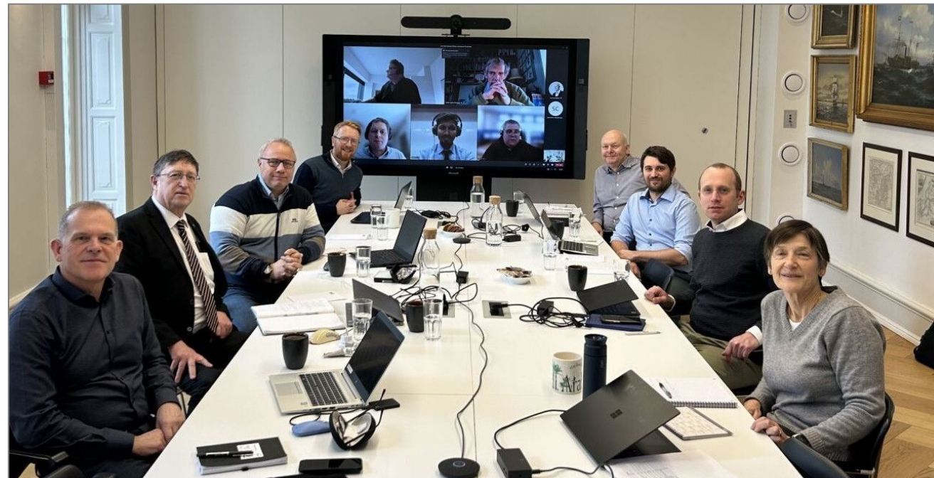
Feb 2024 meeting at BIMCO HQ, Copenhagen